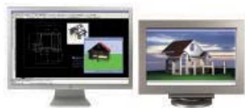
Dual-link monitor with an analog monitor