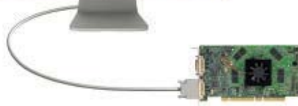
Matrox Parhelia DL256 PCI controlling a 30-inch Apple Cinema HD Display