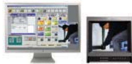
Dual-link monitor with a TV